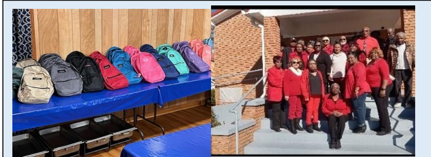
Louise UMC: school supply donations and the UWF members