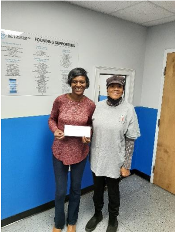
Barnesville Parrish Boys & Girls Club donation 2023