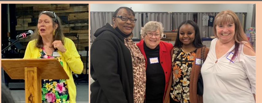
CONNECT & CREATE Event held at Griffin First UMC in Griffin