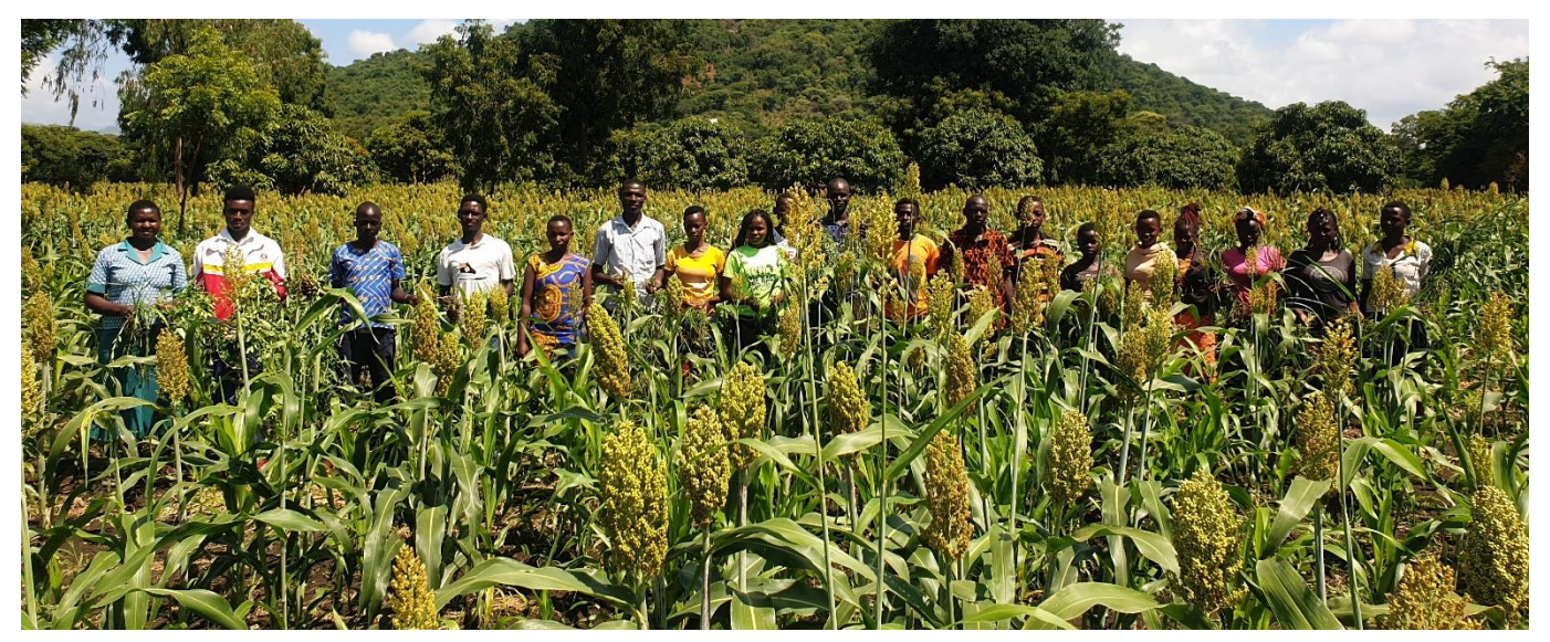
Members of the Upendo Tumbura Group in their group sorghum farm

All the households received tree seedlings. Due to the recent climatic changes that have affected rainfall, Zoe Empowers Kenya has started an initiative to plant more trees and encourages the community to do the same.