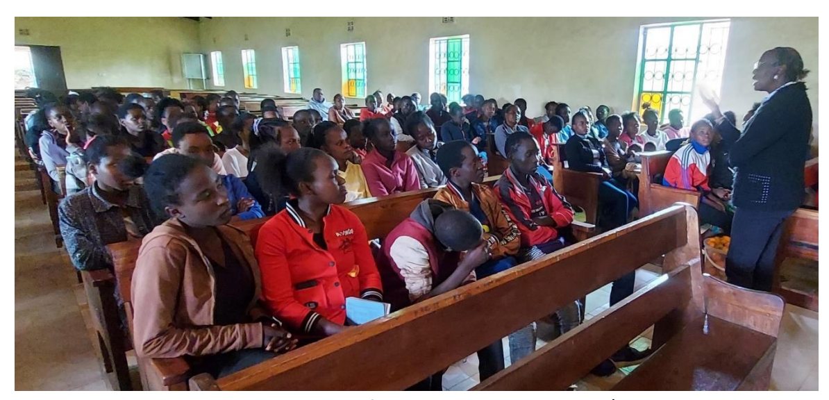
Youth attending one of the training sessions on HIV/AIDS

Housing: Issues of inadequate housing are starting to be addressed with about 42% of the families making improvements to their homes this year. Each group selected one family that was in greatest need to receive assistance from Zoe so that they could construct a home. Each of these families also received two bed frames and two mattresses. Group members helped with construction.